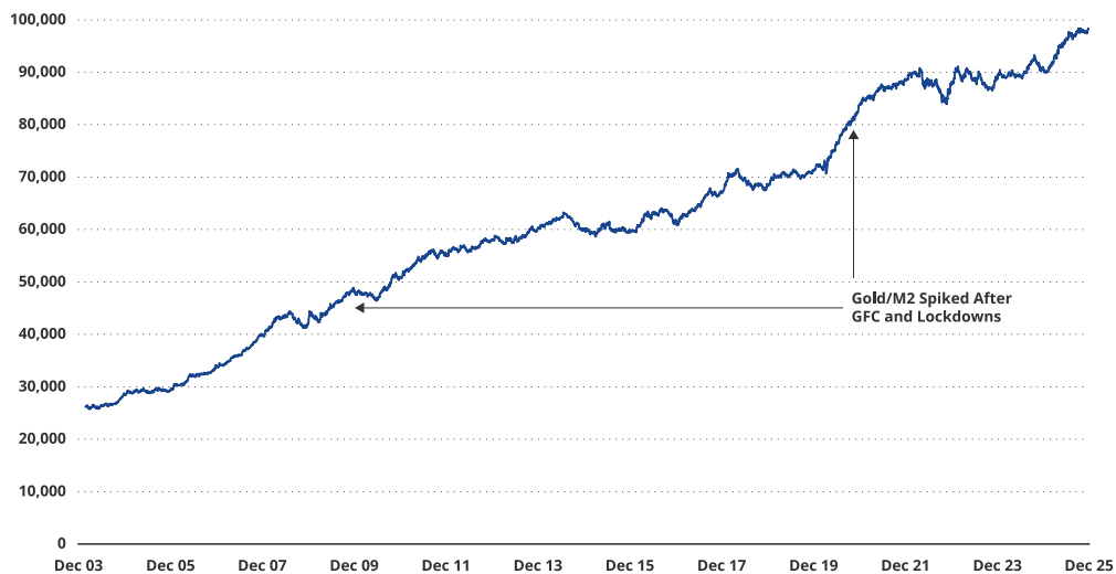
Exhibit 4 – Global Gold Reserves/M2 Nearing $100,000 Per Troy Ounce